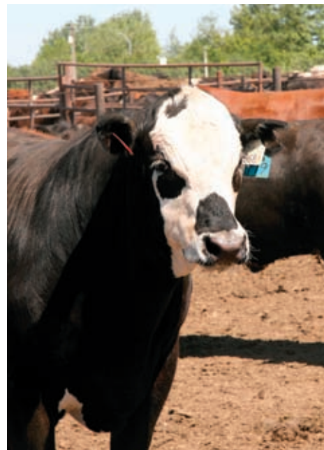
Year one results of the heterosis project showed a $78 advantage for Hereford-sired calves compared to Angus-sired calves. The second calf crop has been harvested and the third crop is at the feedlot in Coalinga, Calif.